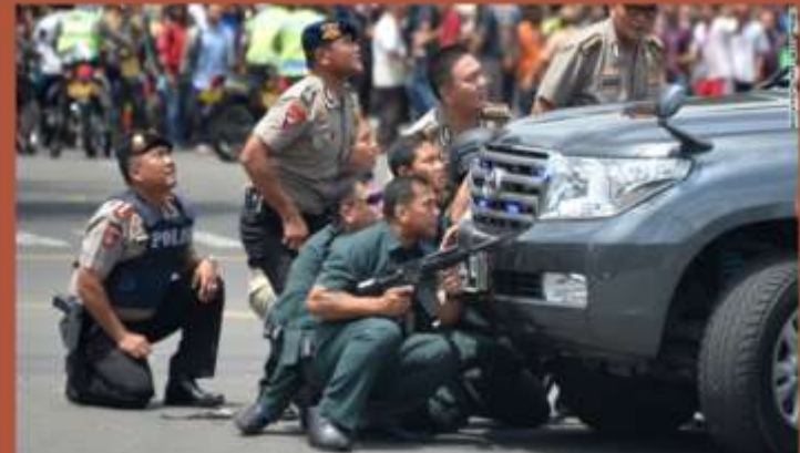
Indonesian police pictured during January 2016 attack by ISIS militants in Jakarta, Indonesia.