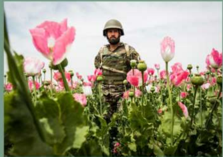
An Afghan soldier walks through a poppy field in Kandahar, Afghanistan in April 2013.