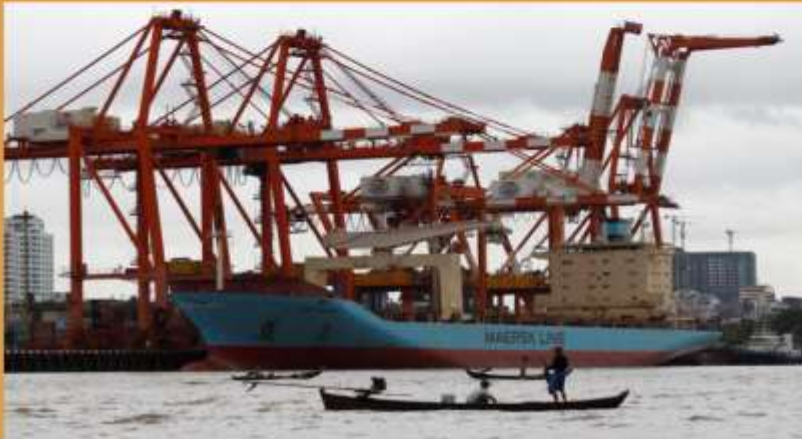
Myanmar industrial port terminal along the Hlaing river in Yangon, Myanmar pictured in June 2016.