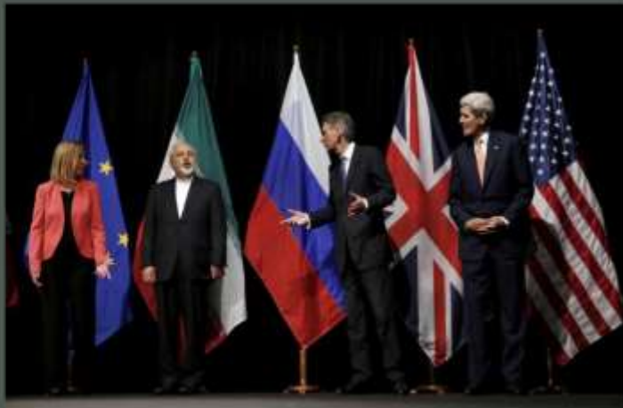
European Union High Representative for Foreign Affairs and Security Policy Mogherini, Iranian Foreign Minister Zarif, Former British Foreign Secretary Hammond, and Former U.S. Secretary of State Kerry pictured at the Vienna International Center in Vienna, Austria in July 2015.