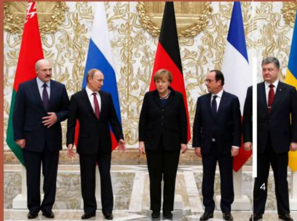
Belarus' President Lukashenko, Russia's President Putin, Germany's Chancellor Merkel, former French President Hollande, & Ukraine's President Poroshenko pose for photo during Ukraine-related peace talks in Minsk, Belarus in 2015.